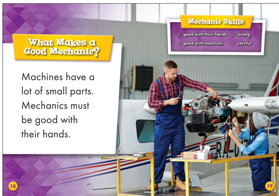
Sample spread from Mechanics